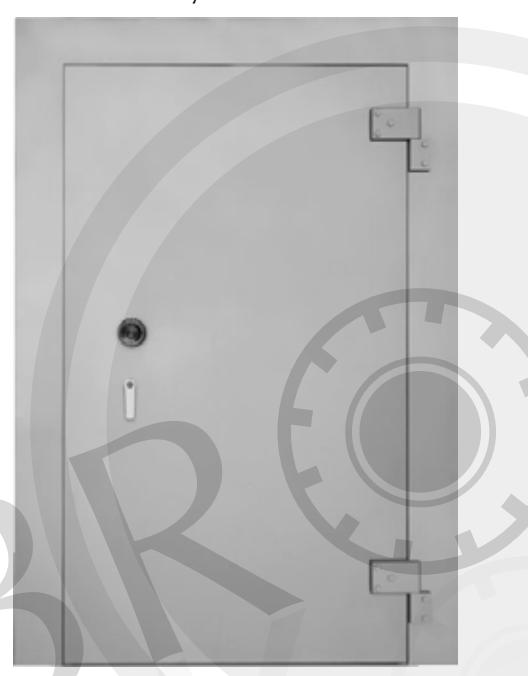
Class 5-A Armory Vault Door