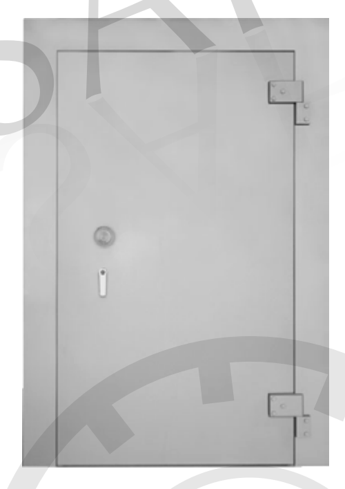
Class 5-B Ballistic Vault Door

Wall Thickness – Standard 8" wall (6-12" available) * Includes wall flanges